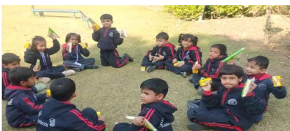
Tiny Nursery Champs on Environment Day